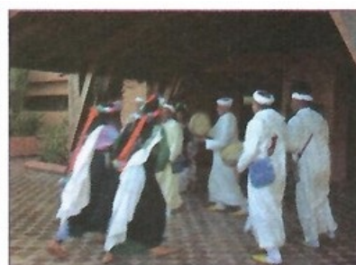
Berber dancers in Agadir