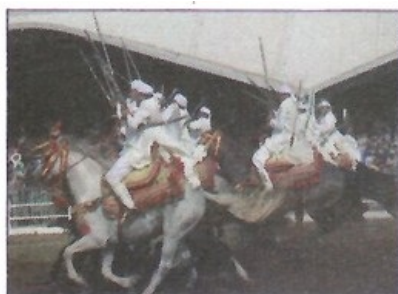
Fantasia shows in El Jadida

Enjoy your holidays in Morocco : visit these places