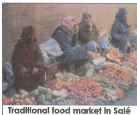
Traditional food market in Salé