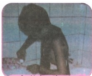
1- He's going to brush his teeth