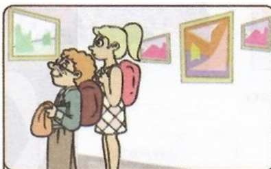
2- They are visiting a museum.