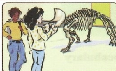
5- They are looking at paintings.