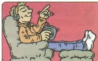
3- Tim is playing a video game.