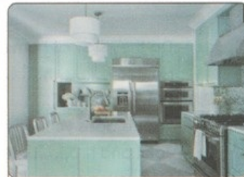
There is a modern kitchen.