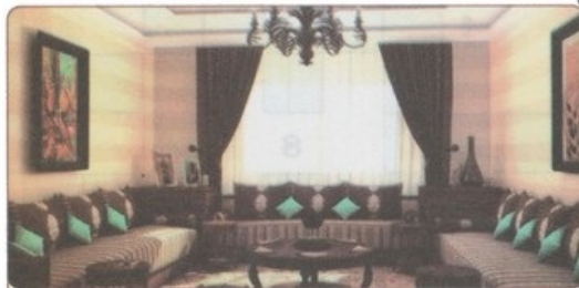
There is a nice Moroccan living-room.