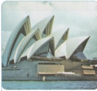
This is the National Theatre in .....