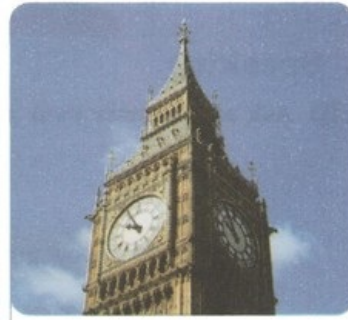
This is Big Ben in..... .....

2. Find photos of cities and monuments in Morocco, then write :