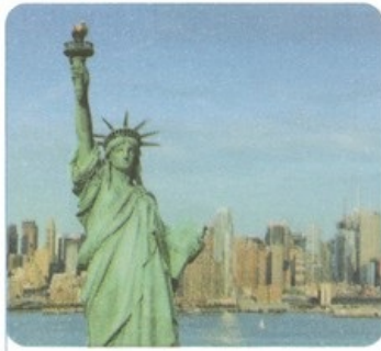
This is the Statue of Liberty in .....