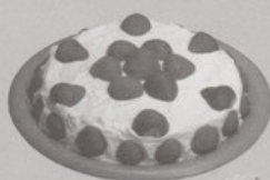
Strawberry Sweet Cake