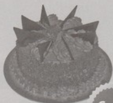
Chocolate Dream Cake