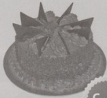
Chocolate Dream Cake