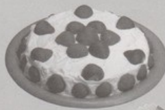
Strawberry Sweet Cake