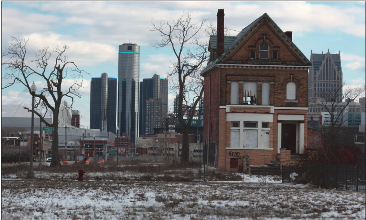
Separated by as little as a city block... a boarded up house in Brush Park with downtown Detroit behind it.

Reuters, published in The Guardian, 5 February 2015