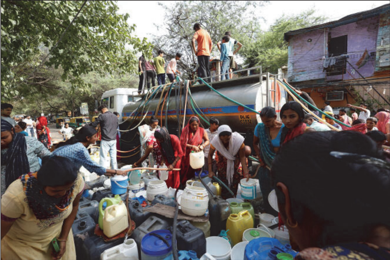
[Residents fill their water containers from a water tanker, New Delhi, India.]