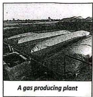
A gas producing plant

[1] Biodome is a Moroccan company that builds plants for the production of cooking gas by recycling waste in farms. The founder, Fatima Zahra Beraich, solves the problem of organic waste in rural areas through recycling. She contributes to the production of energy by turning waste into green energy for farmers.